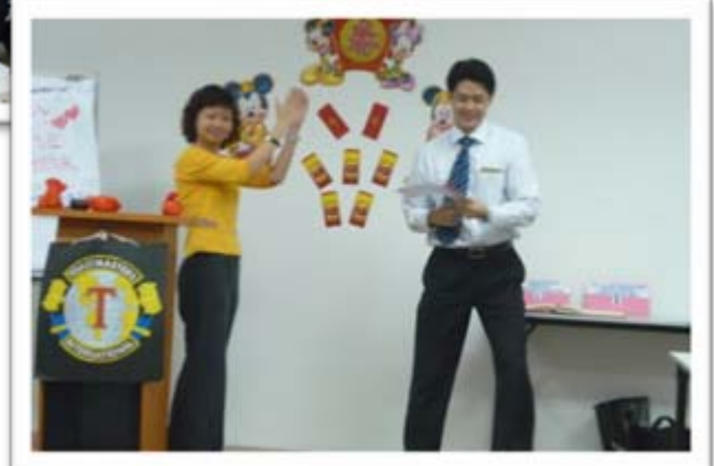
Some pictures from our previous club meetings